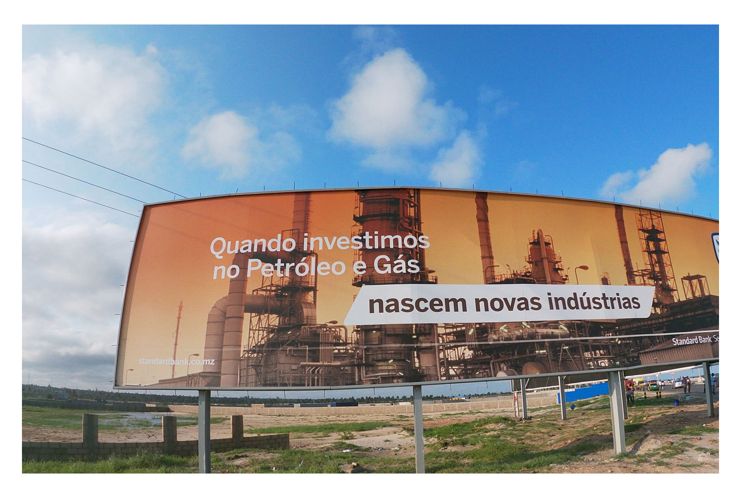
"When we invest in oil and gas, new industries are born". Advertisement of Standard Bank who invests in the gas extraction in Mozambique.

The Gastivist group is driving Global Aktion's efforts in researching and campaigning for better understanding the role of natural gas in the energy transition and its perceived role as a bridge fuel. It comprises of activists that strongly believe that society needs to get to 100% renewable energy as soon as possible in light of the climate emergency. The Gastivist group has been working closely with JA! for a year now and is currently initiating a two-year-long project to address issues related to gas extraction in Mozambique.