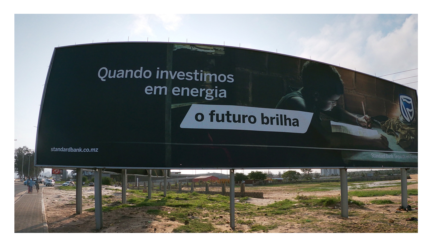
"When we invest in energy, the future shines." Advertisement of Standard Bank who invests in the gas extraction in Mozambique.

Indeed, there is only a handful of resource-rich countries that have actually succeeded in achieving balanced eco-